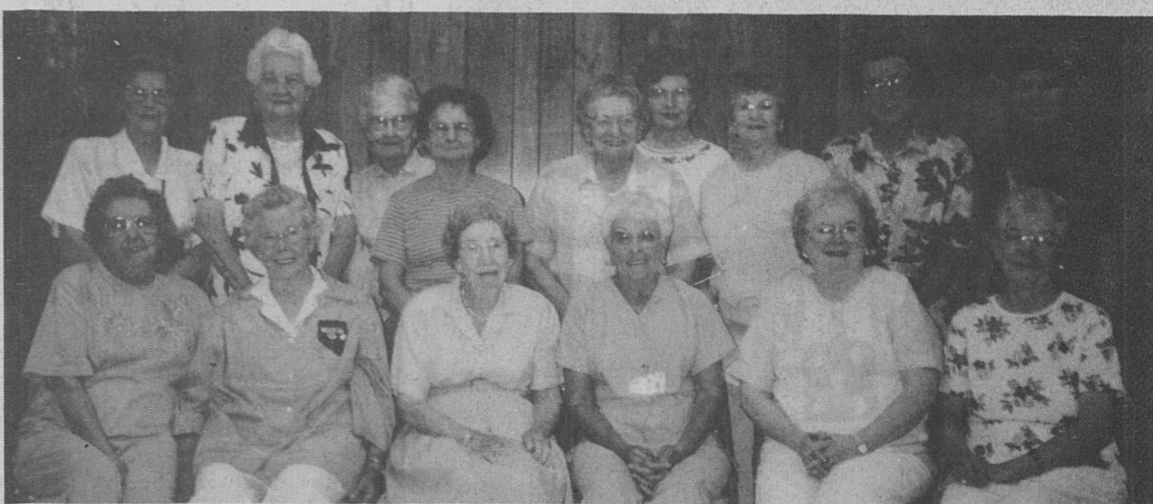
The Rice Medical Center Hospital Pink Ladies Auxiliary

Speakers from El Campo Hospital also gave information on their Auxiliary program.